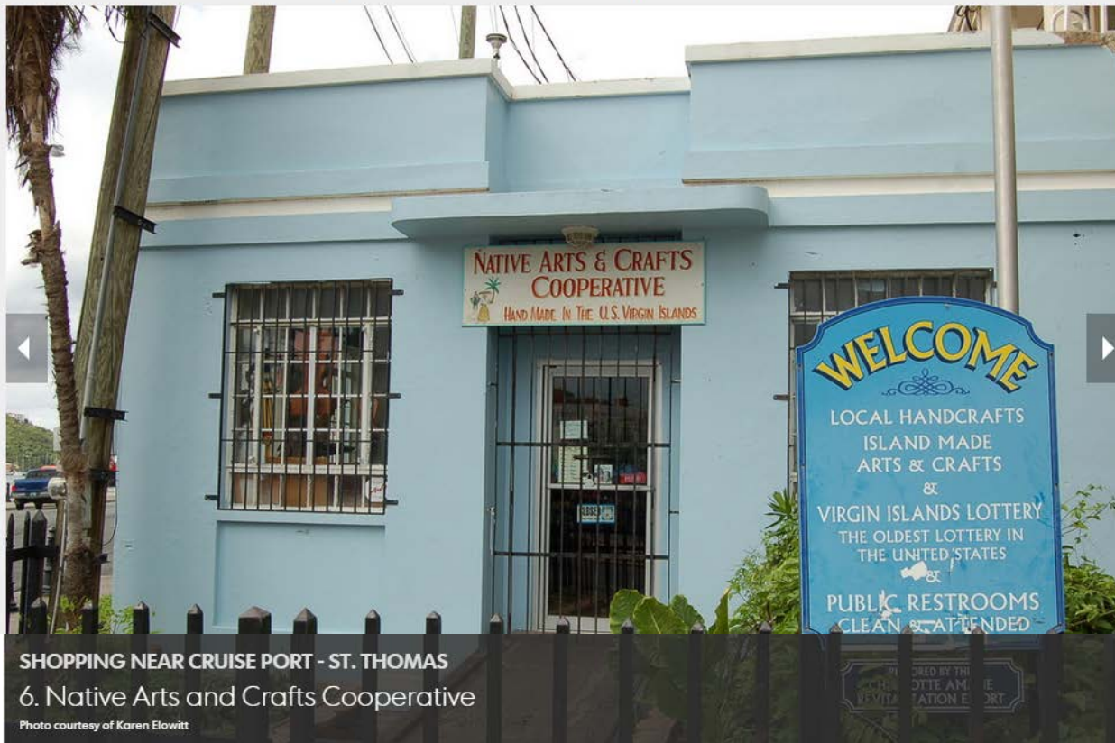
SHOPPING NEAR CRUISE PORT - ST. THOMAS 6. Native Arts and Crafts Cooperative