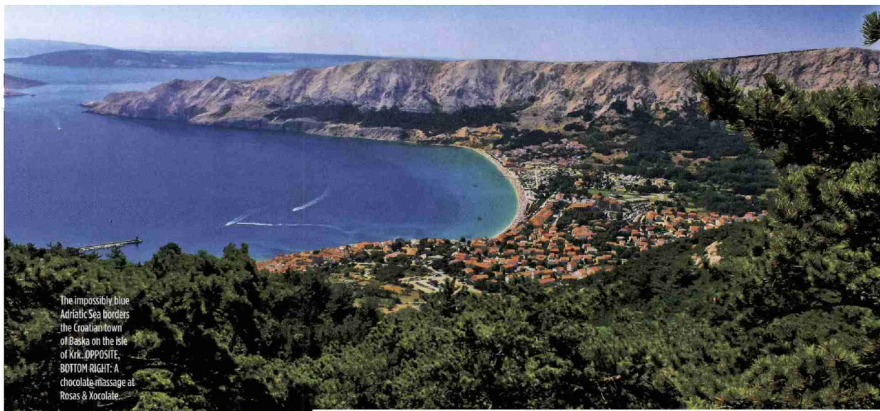
The impossibly blue Adriatic Sea borders the Croatian town of Baska on the Isle of Krk. OPPOSITE, BOTTOM RIGHT: A chocolate massage at Rosas & Xocolate.