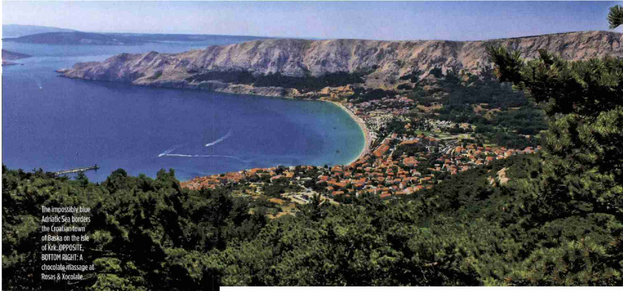
The impossibly blue Adriatic Sea borders the Croatian town of Baska on the Isle of Krk. OPPOSITE, BOTTOM RIGHT: A chocolate massage at Rosas & Xocolate.